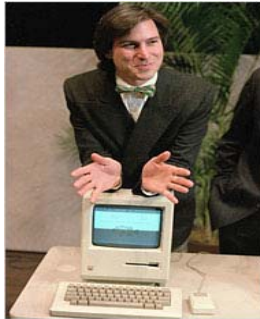
Steve Jobs with Apple Macintosh, 1984